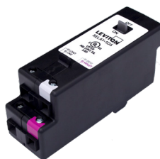
GreenMAX Relay Module Comes complete with four (4) rechargeable Ni-MH batteries. Batteries charge when connected to LumaCAN