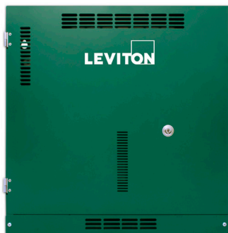
GreenMAX Relay Panel