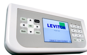
Handheld Display Unit (HDU)